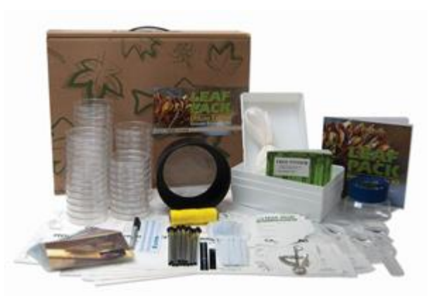
Leaf Pack Network Kits can be found at http://www.stroudcenter.org/lpn/resources

time with expert scientists in the field of freshwater ecology!